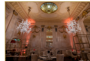
MADHU'S OF MAYFAIR